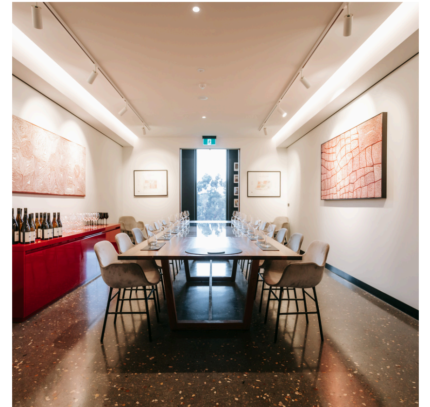
PRIVATE TASTING ROOM