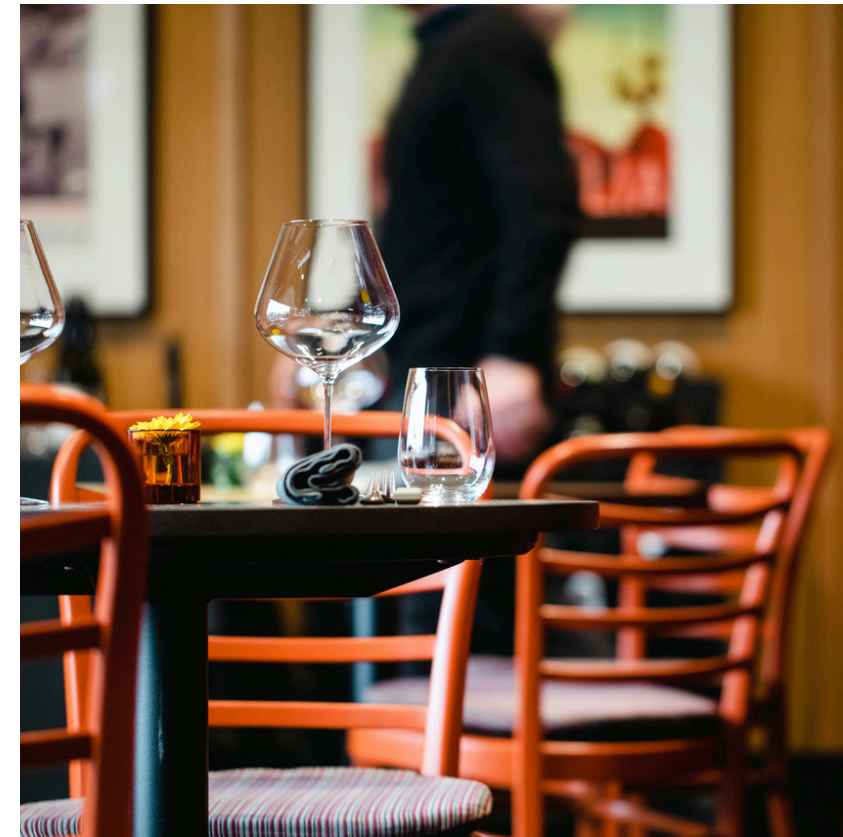
ALLIS WINE BAR